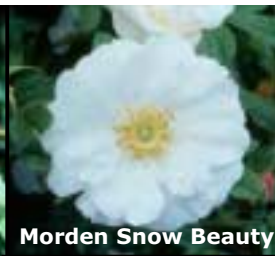
Morden Snow Beauty