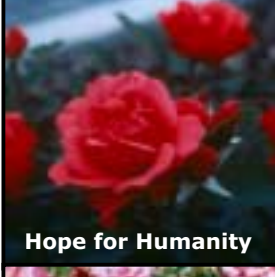
Hope for Humanity